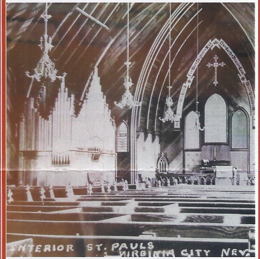
Our building in history—late 19th century interior

WINDOWS: A gift of $5,000 will fund the restoration of one of the church windows. Or $2,500 will restore a window downstairs in the museum area. There are 12 windows upstairs and 12 downstairs, to be named in honor of these gifts.